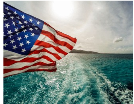
A Week in Greece: Athens, Mykonos & Santorini