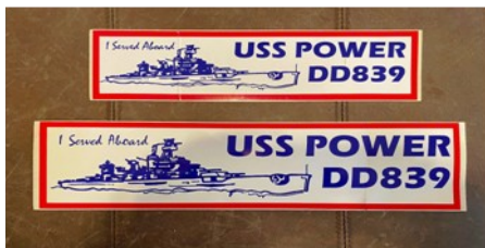
Bumper Stickers: Large or Small $ 3.00