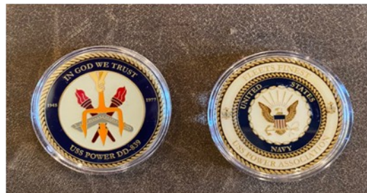
USS Power Challenge Coin $10.00 includes Protective