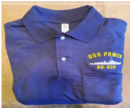
Blue Polo Shirts: Large and XL $29.00 Blue Polo Shirts: Double XL $30.00