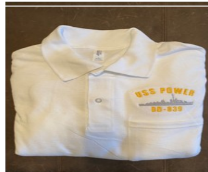
White Polo Shirts: Large and XL $29.00 White Polo Shirts: Double XL $30.00