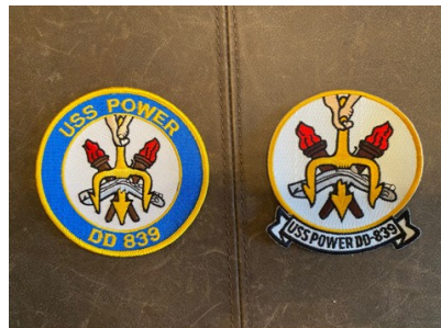
USS Power Patches: Both Designs $ 5.00 each