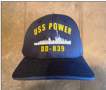
Blue Cap $18.00